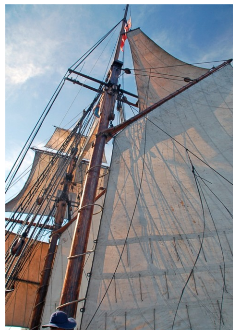
Sail a 19th century adventure aboard the tall ship Enterprize, replica of John Pascoe Fawkner's topsail schooner that founded Melbourne in August 1835.

Fitted with modern safety features and below-deck comforts, she still provides a first-rate experience of sailing before the age of steam and diesel.